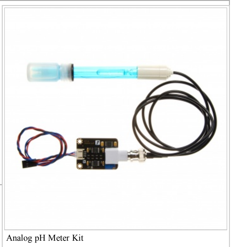
Analog pH Meter Kit